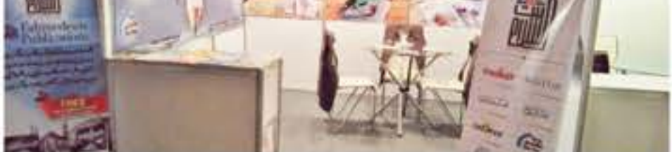
بیت السلام کی سٹینڈ فوڈ بینک کے ذریعے زلزلہ زدگان کو امداد کی

کراچی (پ ر) بیت السلام نے ایک اور منصوبے ائزن شاپ پروگرام کا آغاز کر دیا، جس کے تحت ایبٹ آباد اور میرٹھک کے طلبہ نصاب سماجی اور سماجی امور سمیت باقی ستمبر 30 جون 2017ء