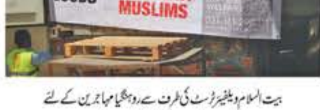
بیت السلام ویلفیئر ٹرسٹ کی طرف سے روہنگیا مہاجرین کے لئے بھیجا جانے والا کیمبل، ٹیے اور پاول

بیت السلام کی سٹینڈ فوڈ بینک کے ذریعے زلزلہ زدگان کو امداد کی