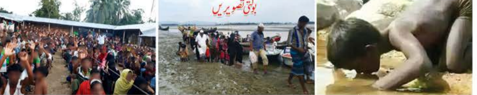
یومیہ ڈیڑھ لاکھ روپی فراہم کرنے اور زلزلہ زدگان کو امداد کی

کراچی (پ ر) موسم سرما کی آمد کے باوجود اس کے لیے بیت السلام نے ساتھی جنگ سے جاہ مال ٹام کئے، ٹیے، کیمبل، گرم لباس، کوٹ، سویٹر اور دوسری ضروری چیزیں مہیا کرنے کے لیے دوسری کارروائیوں کو جاری رکھے ہوئے ہے۔